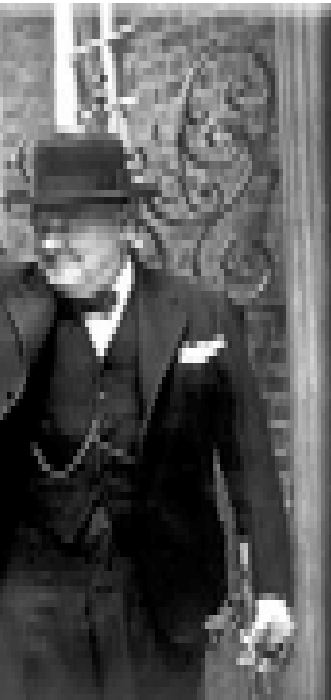
Churchill at 10 Downing Street