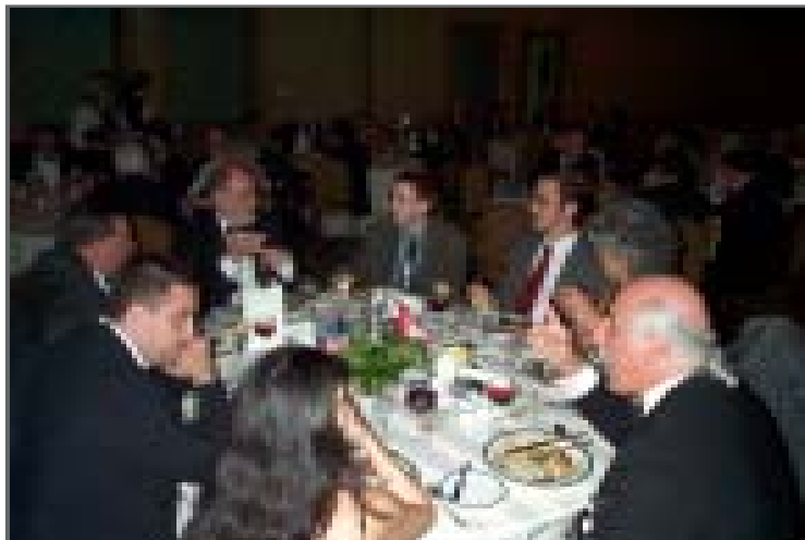
(Left) ISI-sponsored students visit with attendees at the Churchill Society's "Churchill and the Intelligence World" conference held at Leesburg, VA in September 2002.