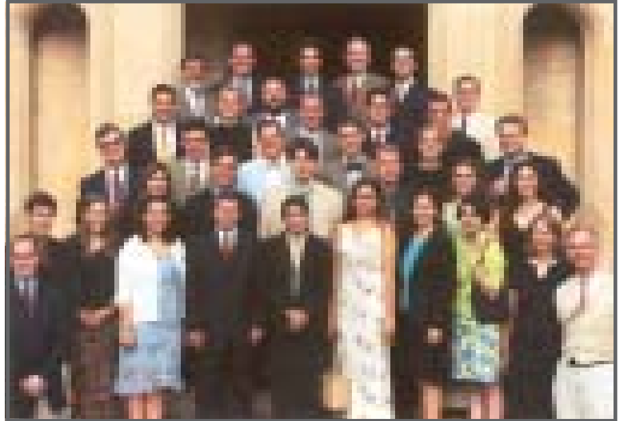
ISI Honors Fellows and their faculty mentors convene at Oriel College, Oxford University.

A select group of Honors Fellows and their faculty mentors